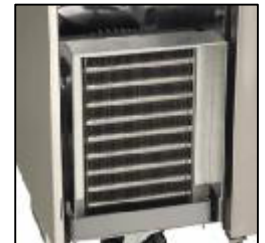
Side-mounted air duct exhausts out the front to use less space and cool more efficiently

The fresh-air/exhaust-air louver design is combined with our exclusive fresh air duct that prevents recycling of the exhaust air through the condenser allowing the Randell units to be 100% front breathing. Randell units typically run 25°F cooler than traditionally designed condenser housings offered by other competitors.