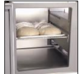
Full depth interior accommodates sheet pans

Randell's 8000N series prep tables uses a proprietary design balanced evaporator Coil that is safely mounted behind the door mullions to provide superior air distribution throughout the full depth and height of the cabinet interior and behind the doors. This protects the coil against damage from over-loading the unit with products.