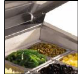
Frost line cools surface of pans for safe food temperatures

Recessed pans set into the cold area allow cold air to blanket the top surface of the product to combat hot ambient conditions and to ensure the product surface is in compliance while minimizing freezing.