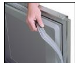
Press-fit gaskets can be cleaned or replaced easily — without tools

Refrigeration runs more efficiently with proper maintenance and the replacement of gaskets that remove easily without tools in a matter of minutes for each door or drawer. Competitive units require screws that allow for the seals to break down for energy loss.