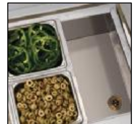
Smooth interior to easily remove debris in the drain area beneath pans

The integral pan ledge and smooth interior of the rail, along with the industry's only standard drain provides the Operator with the easiest prep rail to clean in the industry.