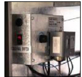
Rail thermostat and on/off switch are independent of base for energy savings

The split refrigeration design that operates the rail independently of the base allows the Operator to adjust rail temperatures as needed without compromising the storage base temperatures. Energy consumption is reduced by as much as 50% by shutting the rail off at night after storing food pans in the base or in other storage refrigeration. Your HACCP program is improved at the same time.