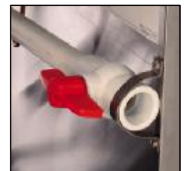
Spills wash right through industry's only standard over-sized rail drain