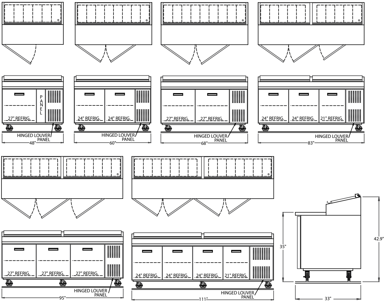
Drawings are to be viewed in the same order as the chart, one drawing to represent refrigerator and freezer units